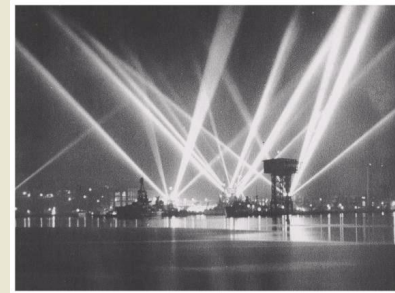
Bremerton Waterfront 1942 Navy Yard Searchlights Scan The Sky

Next time you are visiting the Center, take a moment to view this rare piece of history right here at our Center. Interested in learning more? So was I! Below are a few links entailing searchlight history and how they were used all over the world and here in our very own town.