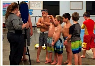
Cub Scouts Discuss Small Craft Safety

Our 1st Scouting merit badge and patch program event took place on December 12th. We had 8 Scouts participate, earning an aquatics merit badge through Cub Scouts and a fun patch through KTAC. What an exciting time to see our programs grow!